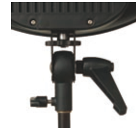
Using TB-U8 to install on the stand ( Optional )

The lamp panel can be installed on the light stand directly, or using TB-U8 to connect with the light stand (By employing the TB-U8, the shooting angle can be adjusted), as shown in the pictures: