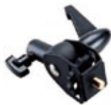
Tilting Bracket TB-U8