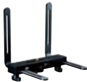
Camera Bracket TMB-176L