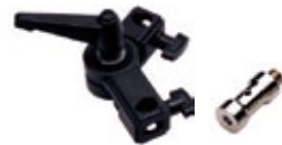
Tilting Bracket CLD-15