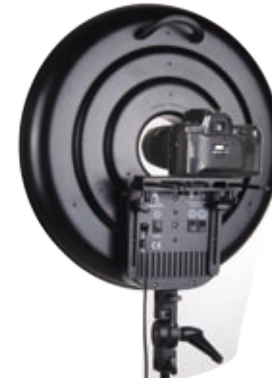
TMB-176L Camera Bracket (Optional)

The lamp panel comes with two different camera brackets as shown in the pictures.