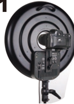
L shape Camera Bracket