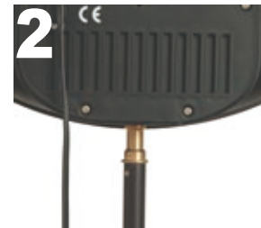
Install directly on the stand (3/8")